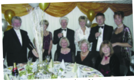
Some members of the Centre Committee